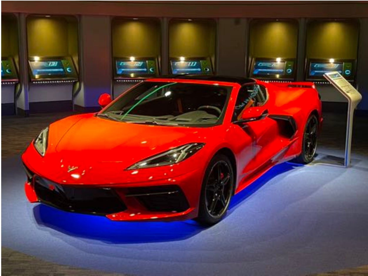
EPCOT – Test Track