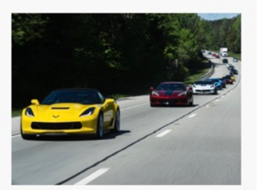
2024 Corvette Caravan