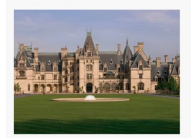
MiM Dragon Run April 28 - May 1, 2024