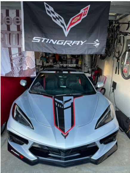
Mo's New Ride