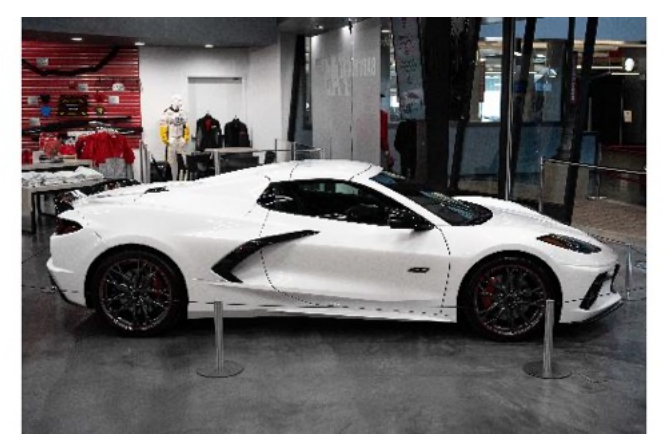
2023 70th Anniversary Convertible VIN 00002 Price: $250.00 Tickets: 1953 Available: 1551 Drawing: April 28, 2023 3:00 PM Central Time

Corvette Raffles! - Currently raffle tickets are only available through the mail, by filling out an order form, or through purchase at the museum or in the State of Kentucky. There are a range of vehicles and raffle types underway, so I encourage you to take a look at the website for a complete listing. I have not won yet, but I remain hopeful. You can't win if you don't play as they say. You can find the latest raffles here - <u>https://raffle.corvettemuseum.org</u>