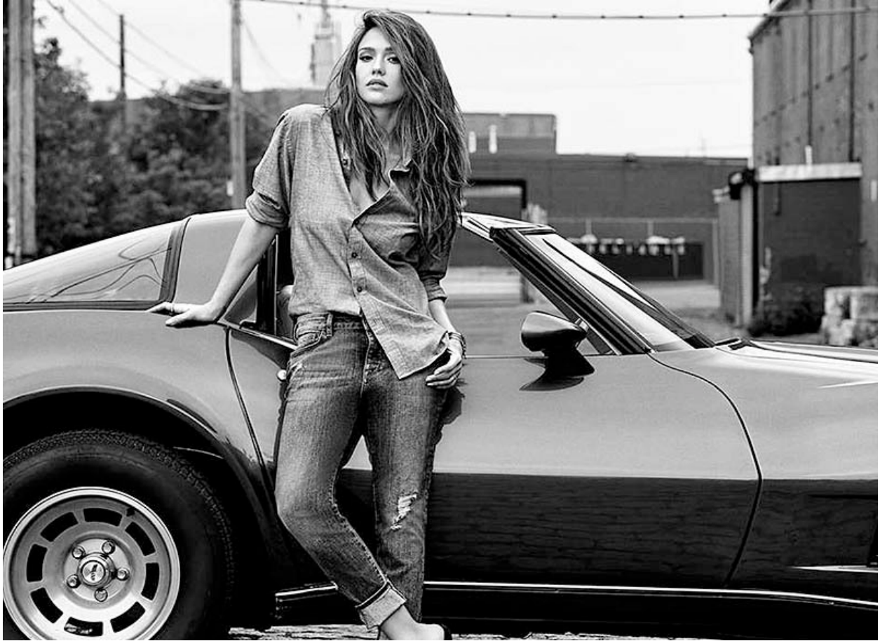
Jessica Alba seems to like 79 Corvettes – Just sayin...OSKER!