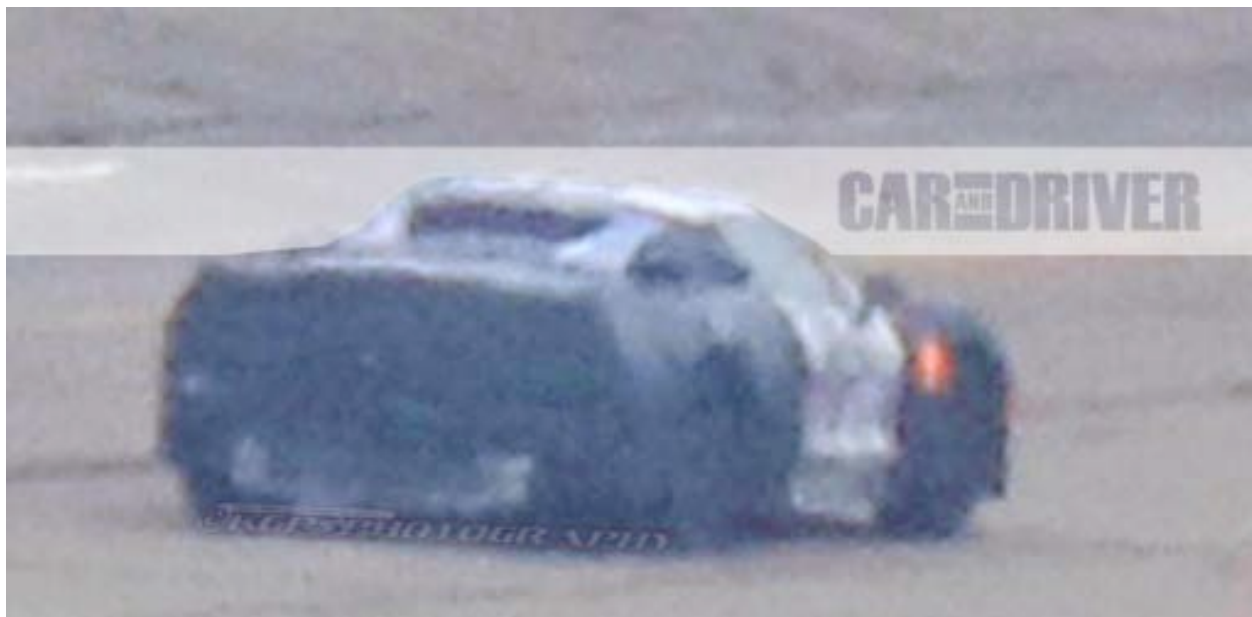
Mid-engine Corvette, Bugatti Veyron or fuzzy picture of a police car – you decide.

Previously we have commented on the rumor mill regarding the mid-engine Corvette. The concept has been in discussion since rumors began about what the C7 would look like. After the C7 Corvette made its debut, the lack of a mid-engine model almost took over some of the press that had been so sure it was happening. In recent weeks, the storm of articles has once again emerged (if it ever really stopped). Car and Driver, Motor Trend, Road and Track, Automobile, Autoweek and more have all devoted significant space to covering a car that “may” be coming. Well after looking through the various articles I think it is probably a safe bet to assume that we will see a mid-engine model in 2018-19. Having said that I also think it is safe to assume we will continue to see front engine models as well along side this already legendary new configuration. Rather than repeat what has been written, below is a collection of the recent articles on the topic as well as some alleged spy photos of a mid-engine Corvette mule. So, we will see what happens. After all, reliable sources have all but confirmed it....again.