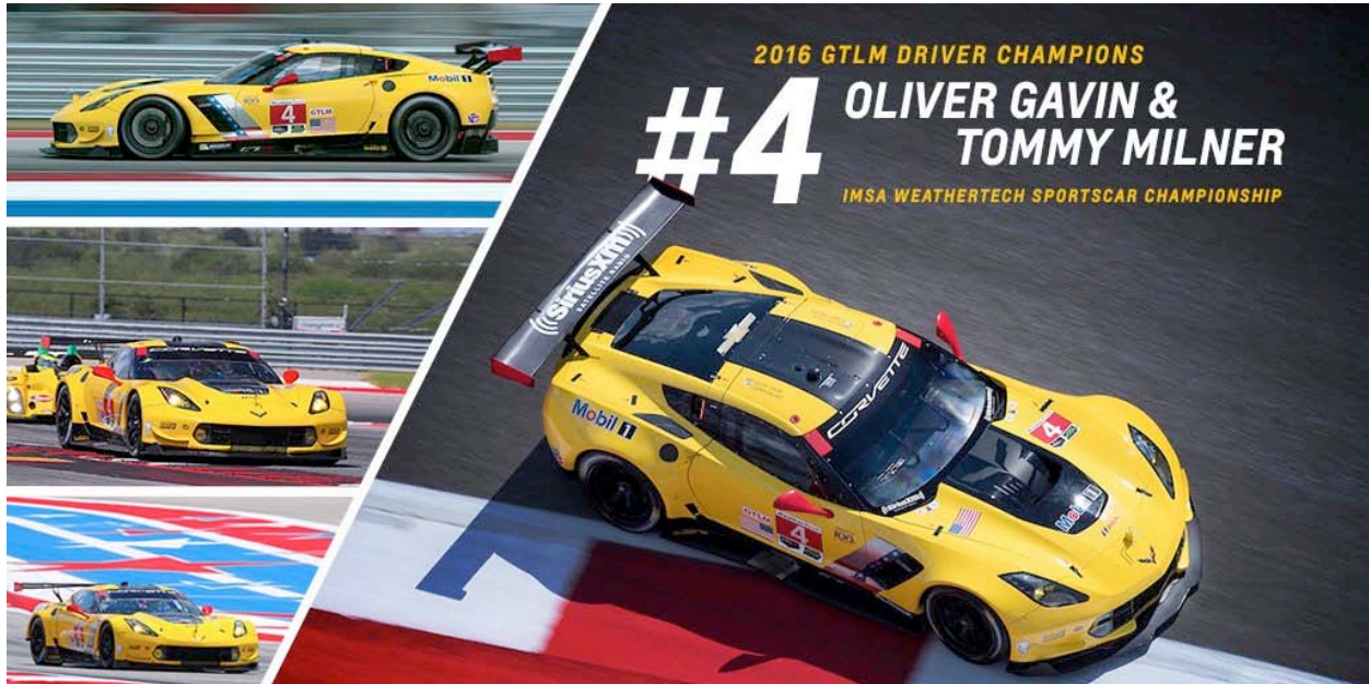
2016 GTLM Champions, Factory Team Champions and GTLM Driver Champions – NUFF SAID!