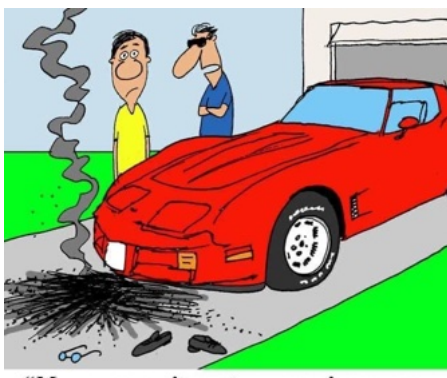
"My new security system vaporizes anyone who gets too close to my Corvette. I'm going to miss Jim."