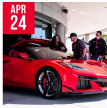
2025 Michelin NCM Bash April 24-26, 2025