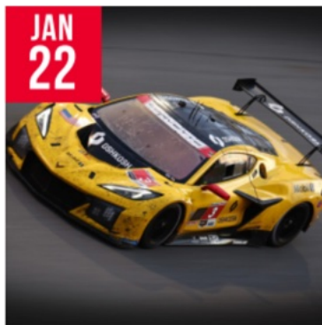
MiM Daytona Rolex 24 January 22-27, 2025