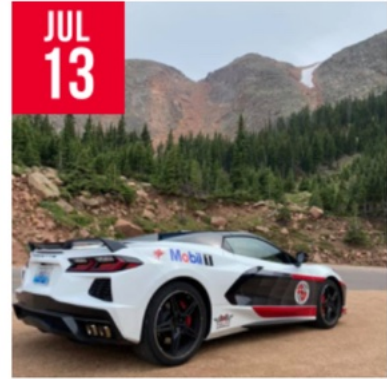
MiM Colorado Springs July 13-17, 2025