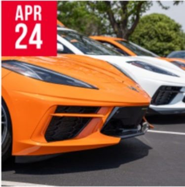
2025 Michelin Bash April 24-26, 2025

exhibit in the Limited Engagement Gallery. Participate in expert-led seminars and tech sessions with GM-certified Corvette specialists, and don't miss the Museum-judged car show, where you can showcase your Corvette or admire others on display. Registration is now open for the April 23-26 event.