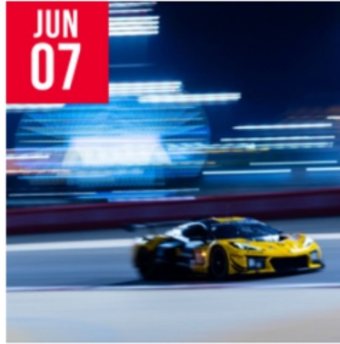
MiM Le Mans Tour June 7-17, 2025