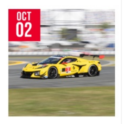
31st Anniversary Celebration August 28-30, 2025